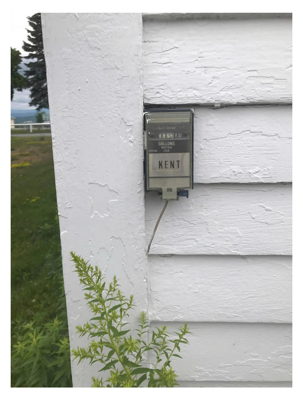
Existing meter read-out location for Church.